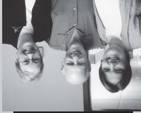
SLM Board Members